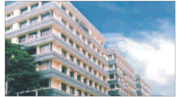
Super Speciality Centre for Retail Banking, Chennai

The customer is a leading bank in UAE in terms of branch network, total assets, total deposits and net profits. It currently operates 80 branches and subsidiaries in Bahrain, Egypt, France, Oman, Sudan, the UK, and the US.