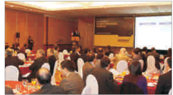
Launch of Intellect 10.0 at 'Convergence', Santiago, Chile