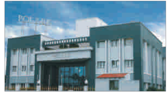
Super Speciality Centre for Insurance and Testing, Chennai

Enable Zero Defect solutions for one of the largest Insurance companies with 30% savings on maintenance costs