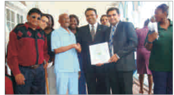
Polaris Team with the Mayor of Georgetown, Hamilton Green, after the IT Roadmap Presentation

Polaris has been chosen to conduct a consulting exercise to lay down an IT roadmap that will allow the City Council of Georgetown, Guyana to implement IT to improve its internal operational efficiency and provide better services its citizens. The roadmap will allow them to implement IT in calibrated steps and transform themselves into a transparent, efficient, agile and socially sensitive local Government.