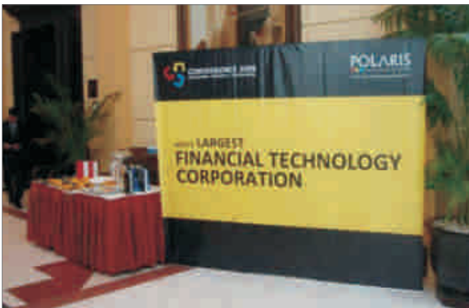
Polaris showcased its key offerings - Global Universal Banking, Intellect SEEC and Consumer Finance, for Saudi market at Convergence, Riyadh