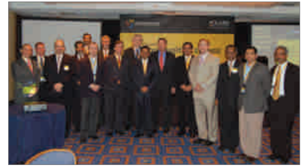
Creating opportunity in change - team Polaris at 'Convergence' New York