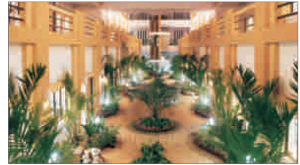
Testing Centre of Excellence - 850 Experts dedicated to serve 'First Time Right' solutions