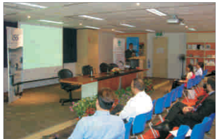
Polaris showcasing its Infrastructure services offerings at the Green IT Event, Singapore