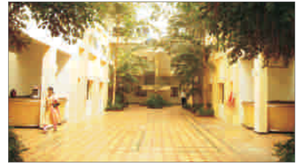
Intellect Court, the birth place of Intellect