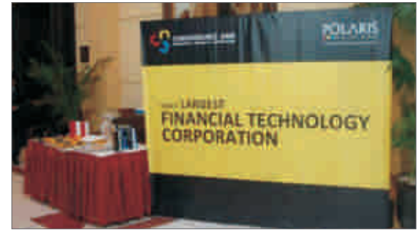
Converging at Riyadh