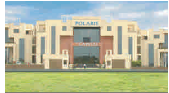
Super Speciality Centre for Capital Markets and Investment Banking, Hyderabad

Polaris developed a Sales Dashboard application for a leading private life insurance company in India. This application is a web-based system, which tracks the performance of the sales team, Advisor Induction Process and displays the performance as a Dashboard where the users can view the status.