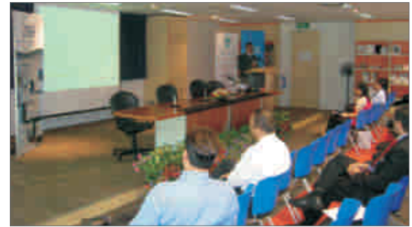
Polaris Team at the Green IT Event