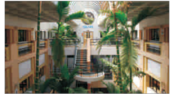
Testing Centre of Excellence, Chennai