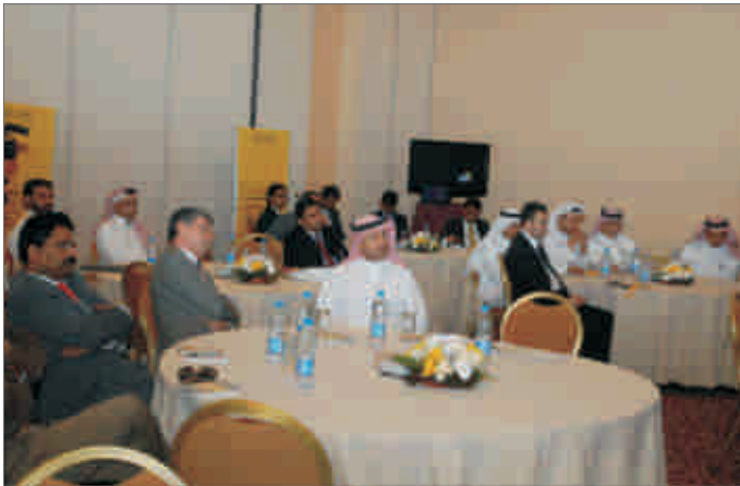
"Growth in global meltdown" - A Panel discussion in progress at Convergence, Riyadh