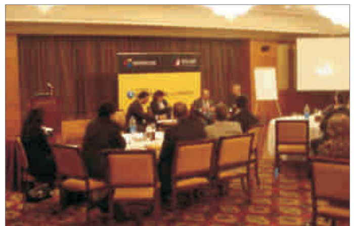
Participants discussing on "Changing face of Consumer Banking in Egypt - Challenges and Enablers" at Convergence, Cairo