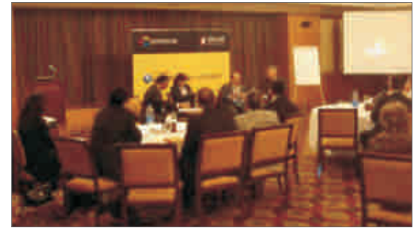
Exhibiting our expertise at Convergence, Egypt