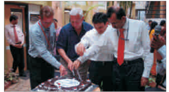
Celebrating lasting relationships