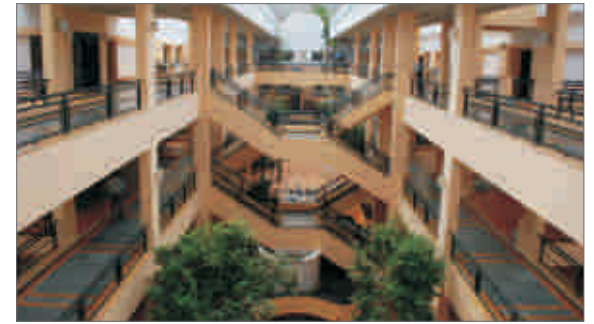
550 Product Engineers and Solution Architects dedicated to creating and continuously enriching the world's largest suite of financial products

Managing 50 million documents complying to the global private banking business in 5 different business groups across 3 geographic regions