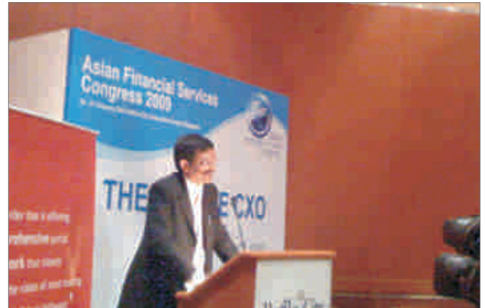
Polaris announcing the launch of Global Universal Banking, Intellect 10.0 at the Future CXO meet at the AFS Congress