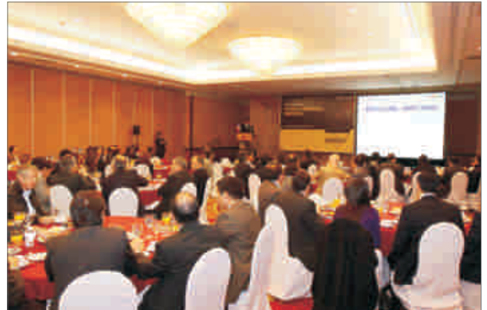
Global Universal Banking Intellect 10.0 - the most comprehensive banking suite, spanning Retail, Corporate and Investment Banking, was launched amidst much applause and appreciation at 'Convergence' in Chile