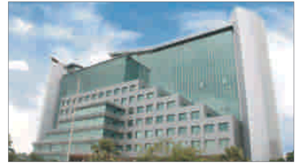
Super Speciality Center for Risk & Treasury, Mumbai