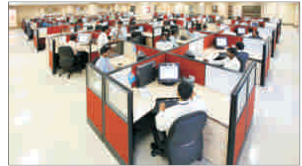
1200 Domain experts in Wealth Management, Securities and Capital Markets serving the industry leaders

30+ country deployment of a payment hub with Straight Through Processing of 3.5 lac transactions per hour