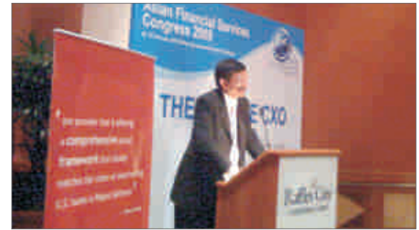
Launch of Intellect 10.0 at AFS Congress