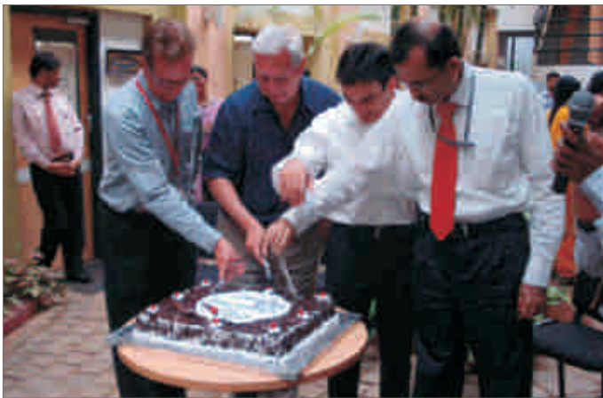
Members from Polaris and DTCC celebrating five years of value creation