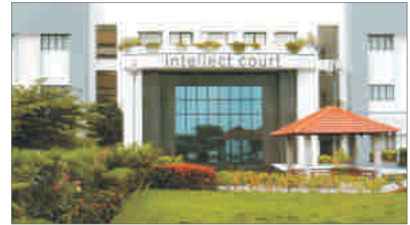
Intellect Court - Home to our Product Group in Chennai