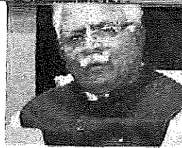
Manohar Lal Khattar, Haryana Chief Minister

It has been reported that Ram Rahim, who heads the powerful Dalit Sikh sect Dera