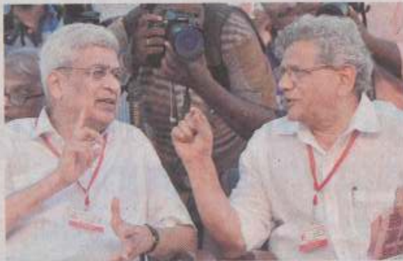
This April 2015 photograph shows former CPI(M) general secretary Prakash Karat and incumbent Sitaram Yechury

ral Committee meeting held in Kolkata, reports had appeared in mainstream media about a 'minority' and 'majority' document to be presented before the panel. "Most of them were either ill-informed about the style of functioning of the CPI (M) as a Communist Party, or, they utilised the occasion to draw motivated and distorted conclusions intended to depict the party leadership in a poor light," Karat alleged.